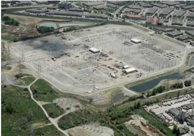
Transformer station similar to the one being proposed in the Woodslee area