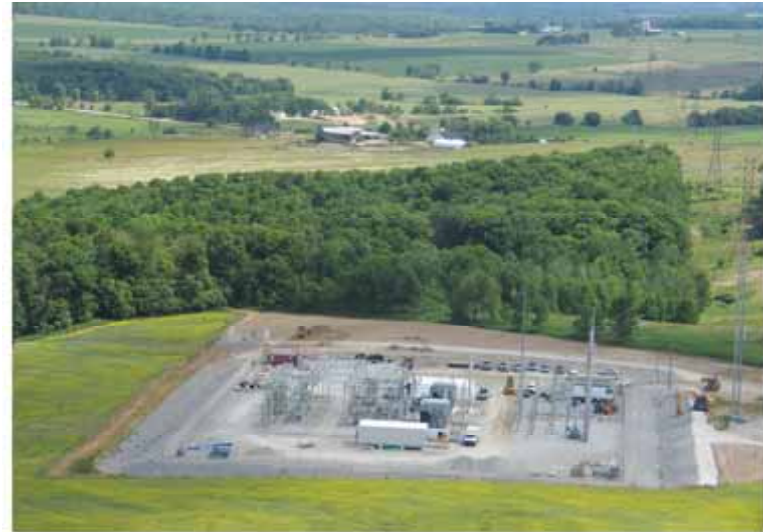
Transformer station similar to the one being proposed in the Leamington area